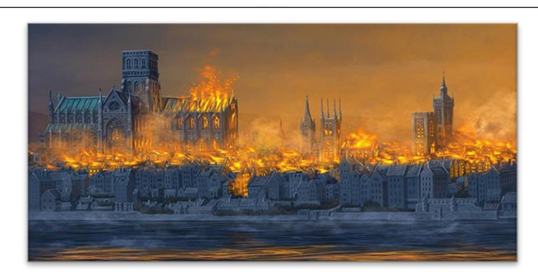
The fire spreading through London.

The lives of significant people from long ago: King Charles II, Samuel Pepys and Sir Christopher Wren.